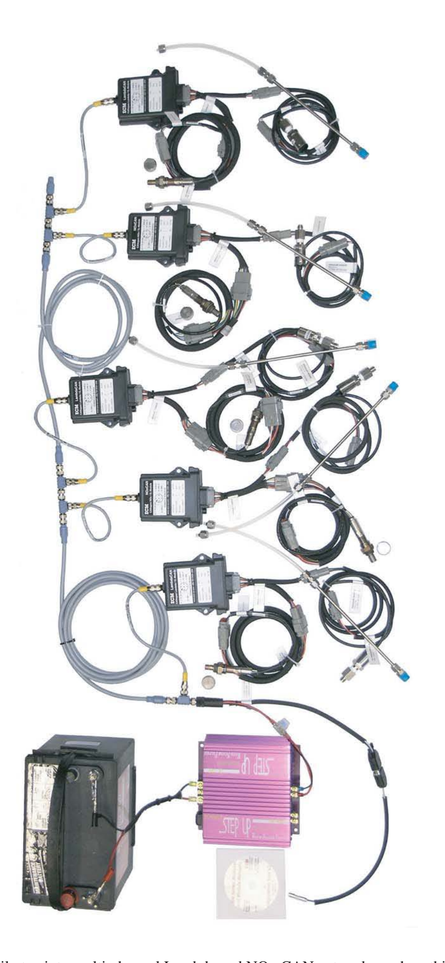
Easily tap into multi-channel Lambda and NOx CAN networks such as this.